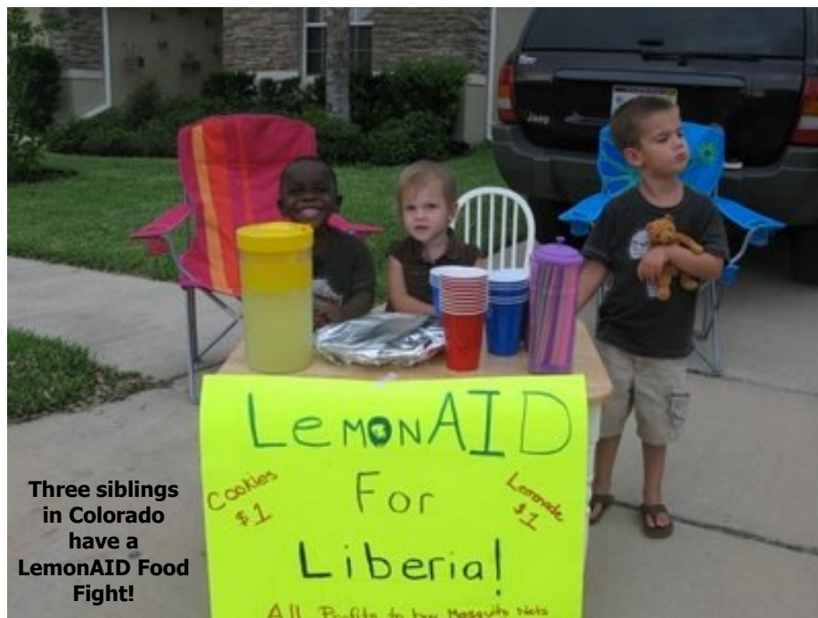
Three siblings in Colorado have a LemonAID Food Fight!

The possibilities are endless! Get creative and have fun!